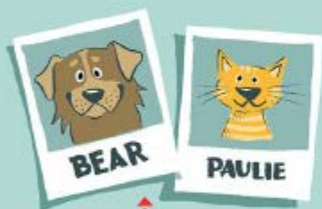
Photos of your pets (printed and on your phone)

Copies of pet medical records (printed and online or stored in an app)